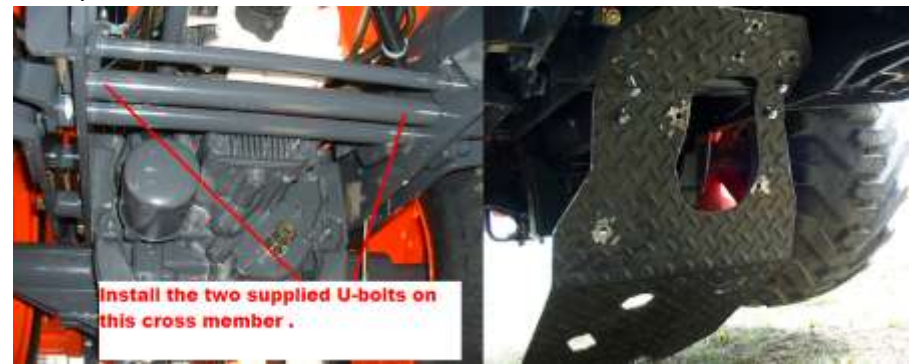
Photo B:For all BX24xx & higher, put the 4-nuts on U-Bolts & leave some play. Some of newer BX, there's small factory skid plate that must be uninstalled. These will require 14mm or a 9/16 wrench/socket to remove it.

Photo A(Above): For all BX23xx & lower series.